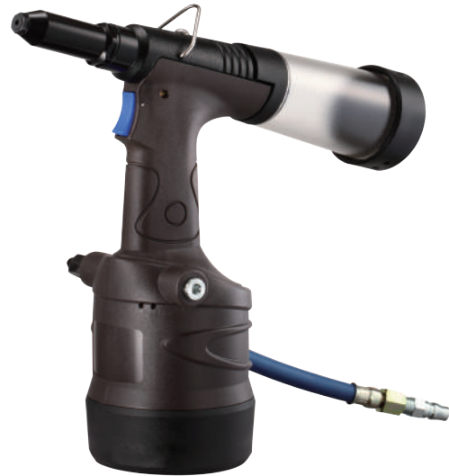
PHR-0101 3/16" Industrial Air-Hydraulic Riveter ** with Vacuum Function & 3-Jaws **